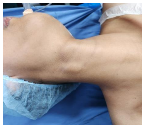
Fig:1 Preoperative presentation

of the C5 vertebral body and appeared isotense on T1 weighted imaging, isotense to hypotense on T2 weighted imaging, with no evidence of diffusion or restriction, features likely suggestive of branchial cleft cyst. The results of FNAC revealed characteristics of a branchial cleft cyst. These observations led to the patient being operated on, and the cyst removed was examined. The gross discovery revealed that the tissue was 3 cm by 3 cm in size and that the excised sample was primarily brownish in colour. The cystic cavity of the specimen included mucoid material, and the cyst wall was quite thick and covered in papillary projections.