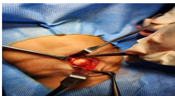
Fig 2b: Intraoperative excision of the branchial cleft cyst