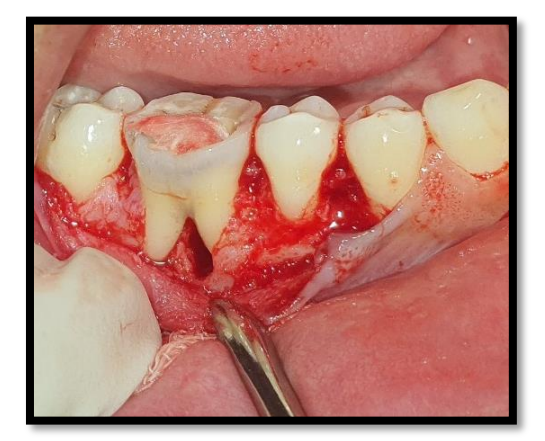
FIGURE 3: DEFECT AFTER DEBRIDEMENT