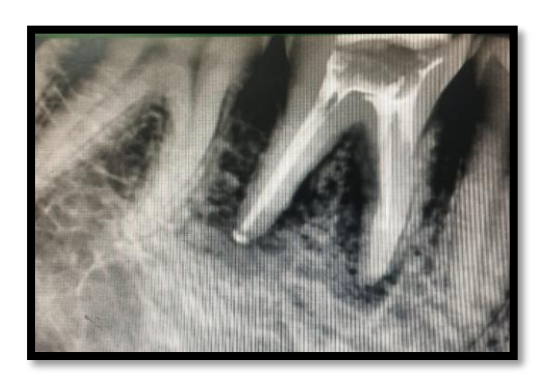
FIGURE 2: PREOP RVG SHOWING BONE LOSS

Based on all the clinical and radiographic findings, diagnosis made was, "Primary Endodontic lesion with Secondary Periodontal involvement".