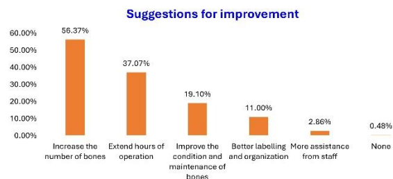
Fig. 2: Chart showing suggestions for improvement of the Bone library

In the open-ended question section, students mainly suggested to increase the number of specimens (56.37%), extend library hours (37.07%) and better maintenance (19.10%) of the specimen. Better labelling and organization (11.1%), more assistance from staff (2.86%) too was mentioned by the students. (Fig. 2)