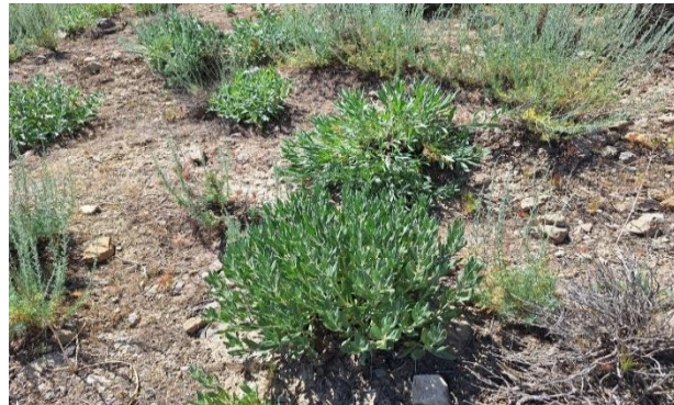
Figure 8. Perovskia scrophulariifolia - Ajuga turkestanica - Eremurus baissunensis + Hordeum murinum + Bunium hissaricum association where A. turkestanica occurs.

9. Eremurus luteus - Ajuga turkestanica - Prangos pabularia + Taeniatherum caput-medusae + Koelpinia linearis plant association. This association was identified on May 14, 2021, in Pasurkhisoy village, on rocky-gravelly, reddish soil, with a 27° south-facing slope (N38.111679 E67.2269). In this association, the plant cover consists of 23% Eremurus luteus , 17% Ajuga turkestanica , and 6% Prangos pabularia . The plants