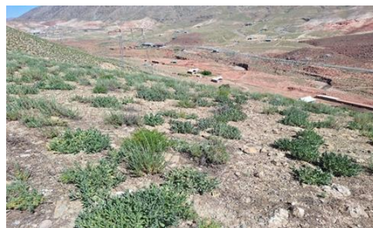
Figure 3. Ajuga turkestanica - Artemisia tenuisecta - Phlomis spinidens + Carex pachystylis + Diarthron vesiculosum + Nigella integrifolia plant association.

№12 30.05.2020. On the southern side of the road going from Gaza village towards Denav district.