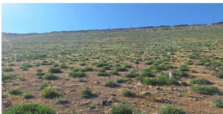
Figure 2. Ajuga turkestanica - Ephedra ciliata - Onosma atrocyanea + Bromus scoparius association.

№9 15.05.2020. Southern side of Panjob village, around the Sherabad River.