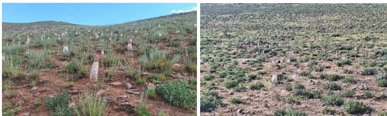
Figure 9. Eremurus luteus - Ajuga turkestanica - Prangos pabularia + Taeniatherum caput-medusae + Koelpinia linearis association where A. turkestanica occurs.

№32 15.05.2021. Northern side of Derbend village, Baysun district, at an altitude of 1200 meters above sea level.