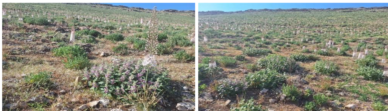
Figure 10. Salvia bucharica - Ajuga turkestanica - Gallium pamiralaicum + G. spurium association where A. turkestanica occurs.

11. Prangos pabularia - Artemisia tenuisecta - Ajuga turkestanica + Galium pamiralaicum + Prunus verrucosa + Poa bulbosa plant association. This association was identified in the southwestern part of Charvoqsoy village on May 8, 2021, and is found on brown soil, with a 75° north-facing slope (N38.26241 E67.04405). In this association, the plant cover consists of 17% Prangos pabularia , 14% Artemisia tenuisecta ,