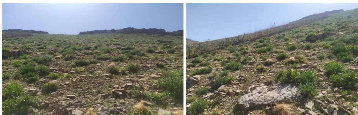
Figure 1. Ajuga turkestanica - Poa bulbosa - Ehinops lipskyi - Festuca maritima + Artemisia tenusecta + Ziziphora tenuior association.

№5 16.05.2020. 18 km north of Derbend village towards Baysun city, on both the left and right sides of the road.