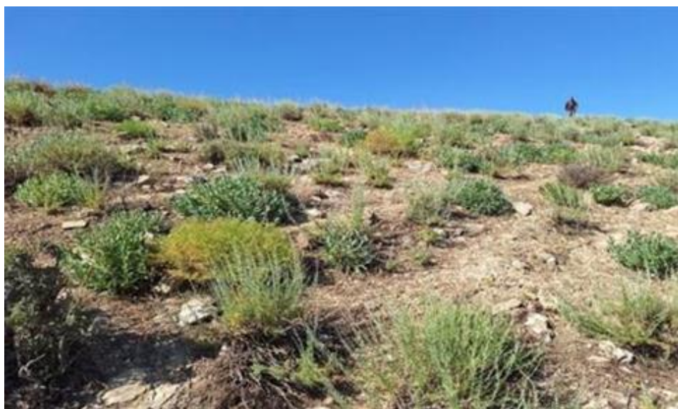
Figure 4. Ajuga turkestanica - Crambe cordifolia - Bromus tectorum + Inula grandis plant association.

№16. 02.06.2022. On the right side of the Tulkiysay valley, Jiydalisay village.