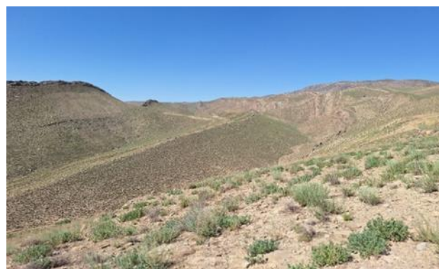
Figure 6. Artemisia tenuisecta - Ajuga turkestanica - Salvia bucharica + Rosa kokanica + Taraxacum maracandicum + Koelpinia linearis association where A. turkestanica occurs.

№24. 17.06.2020. Around Bocharbog village, Dehkanabad district, on both the right and left sides of the road, less than 6 km from Chulbair village.