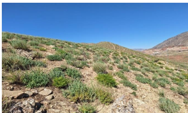
Figure 7. Rosa kokanica - Ajuga turkestanica + Mixtoherbosa [Mixed Herb] association where A. turkestanica occurs.

8. Perovskia scrophulariifolia - Ajuga turkestanica - Eremurus baissunensis + Hordeum murinum + Bunium hissaricum plant association. This association was studied near Dugoba village, with a red sandy soil and a 33° west-facing slope (N38.19150 E38.19150) on June 4, 2020. In this association, the plant cover consists of 18% Perovskia scrophulariifolia , 16%