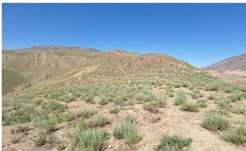
Figure 5. Artemisia tenuisecta - Ajuga turkestanica - Poa bulbosa + Galium pamiralaicum + Sophora pachycarpa plant association.

№20. 29.06.2020. Around Bocharbog village, Dehkanabad district, on both the right and left sides of the road, less than 6 km from Chulbair village.